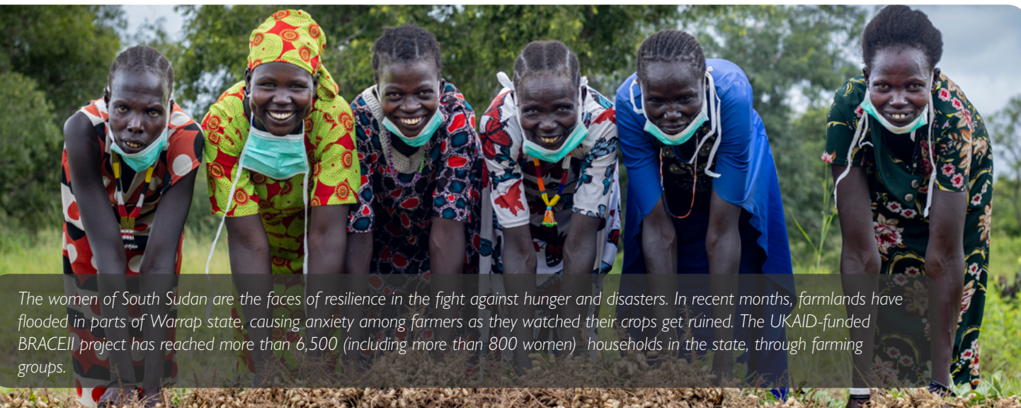
The women of South Sudan are the faces of resilience in the fight against hunger and disasters. In recent months, farmlands have flooded in parts of Warrap state, causing anxiety among farmers as they watched their crops get ruined. The UKAID-funded BRACEII project has reached more than 6,500 (including more than 800 women) households in the state, through farming groups.