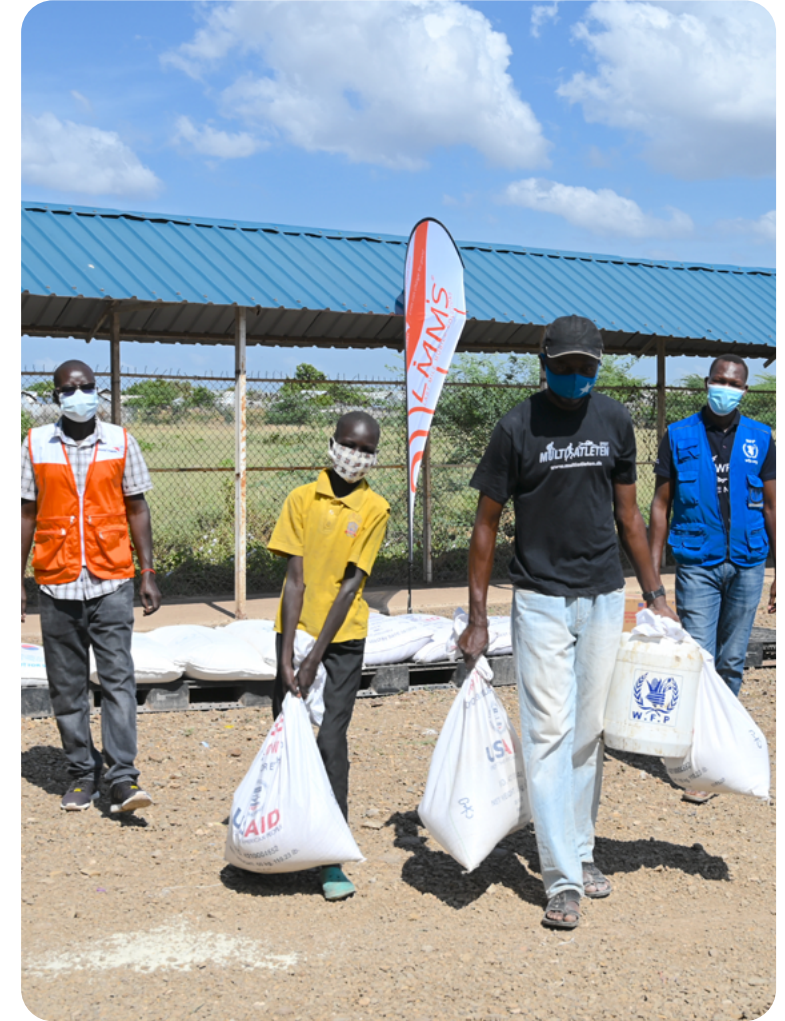
The food distribution programme at Kakuma Refugee Camp in Kenya helps improve the health and nutrition of children and families. World Vision's Citizen, Voice & Action approach has helped refugees understand the food distribution process.

*The impact numbers take into account the risk of double counting.